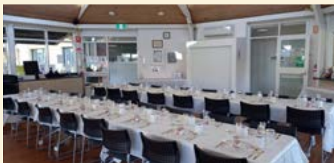
Surrey Hills Neighbourhood Centre

Rooms available at very competitive rates. Harrier's Pavilion is also available for event or party hire.