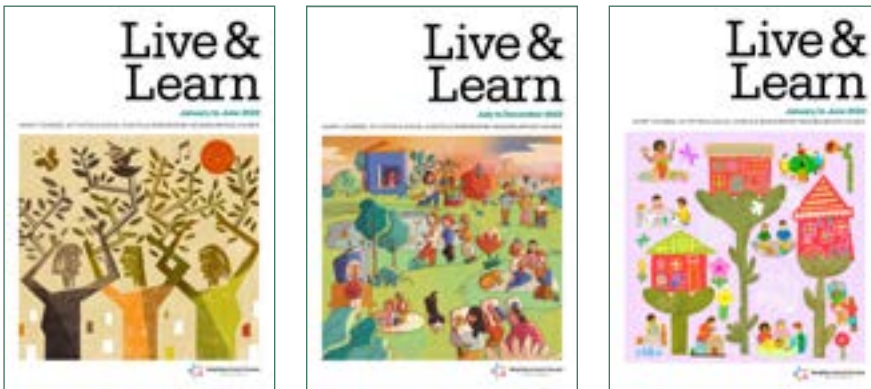
Previous Live & Learn Covers

Design Brief: Submit an artwork to feature on the front cover of the Boroondara Neighbourhood House 'Live & Learn' brochure. The artwork must be vibrant, eye catching and feature a person or people. Your piece will reflect something about the Boroondara community and its residents.