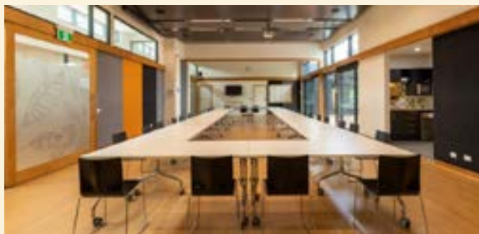
Ashburton Community Centre

The Copland Room/Hall, meeting rooms and a registered kitchen available for hire for community, not-for-profit and commercial use. Suitable for meetings, classes and workshops. Discounts available for regular hire.