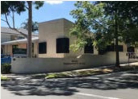
Alamein Neighbourhood and Learning

Your 4-page lift-out guide to Boroondara Neighbourhood Houses courses and activities for 2024. With 11 Neighbourhood Houses in Boroondara, we have a lot to offer. This is your handy reference that shows an overview of what you'll find at our Centres, where to find us and how to contact us.