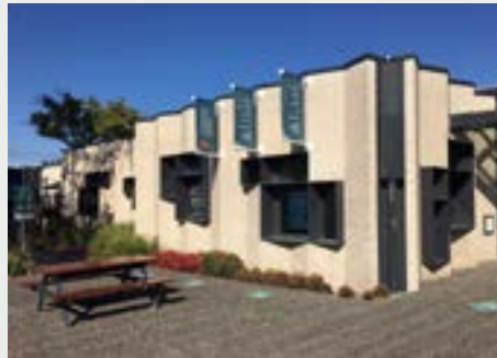
Ashburton Community Centre