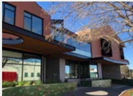
Camberwell Community Centre