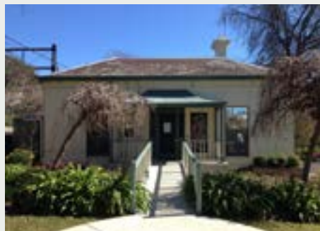
Hawthorn Community House