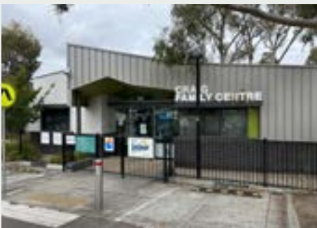
Craig Family Centre