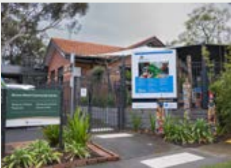
Bowen Street Community Centre