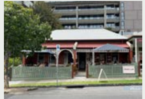
Kew Neighbourhood Learning Centre