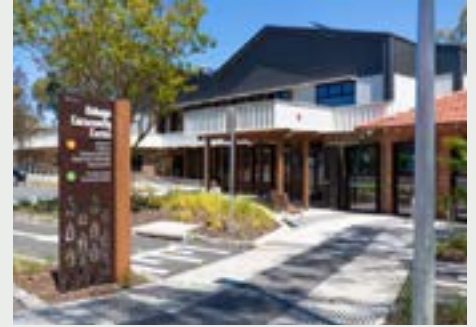
Balwyn Community Centre