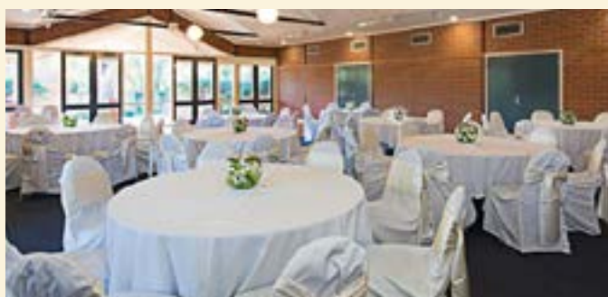
Balwyn Community Centre and Function Centre

Beautiful function room for parties, workshops and seminars for up to 120 people. Smaller spaces for up to 50 people include meeting rooms, art studios, classrooms, kitchen and a craft workshop. Available for hire to individuals, businesses and community organisations. Discount available for regular hirers.