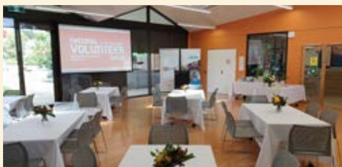
Trentwood Community House

Modern well-equipped centre with various sized rooms for hire. There is a fully equipped large kitchen off our Foard Williams room. Community groups, family gatherings, corporate workshops and functions welcome.