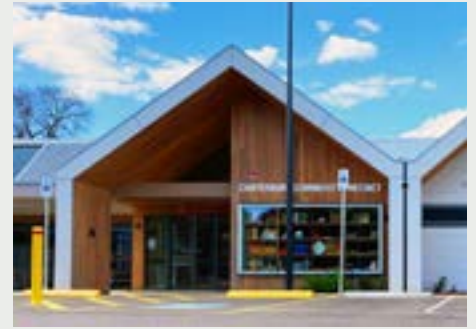
Canterbury Neighbourhood Centre