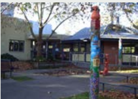
Surrey Hills Neighbourhood Centre